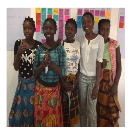
Figure 4: A group of adolescent girls who participated in the cocreation workshop

Five questions, based on formative research insights, guided Activity 1: