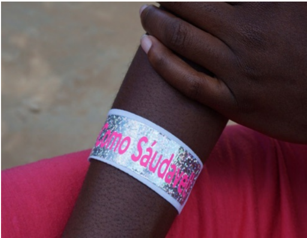
Figure 7: A facilitator leading a Rapariga Game (L) and a girl showing her Pledge activity bracelet

was clear this link would have to be strengthened in further iterations.