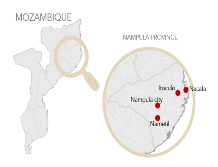
Figure 1: A map of Mozambique showing the relevant cities in Nampula Province.

To better understand habits of and influences on low-income adolescent girls, GAIN and ThinkPlace conducted two immersive, formative studies in Nampula Province. The first was conducted in May-June 2017 in the urban areas of Nampula City (inland) and Nacala Porto City (on the coast) in the northern part of the country, where there is high population density and a large proportion of the population are adolescents (36). In July 2018, a second formative research study was conducted, this time in the rural communities of Nametil (Mugovolas District) and Itoculo (Monapo District) (37). The geographic areas are shown in Figure 1.