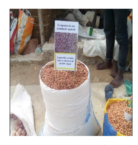
Figure 10: An example of the Food Tags

Using community and group events as an opportunity to engage groups as collective organisations was an idea