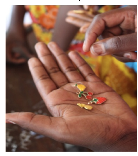
Figure 14: Sample beads given to reward mission

team captain who also lived close. This peer support system (the team and the captains) allowed girls to help each other and work as a team, sharing resources and overcoming challenges. After the session, feedback was elicited from the girls and the mentors about clarity, accessibility, variety of rewards and level of difficulty of the missions. For sessions two and three, the game materials were redesigned to be easier to understand and more visual, better aligned to the girls' low literacy levels. The game was tested again, and post-test interviews were conducted with girls, mentors, and mothers. Though there was some confusion about meeting times that impacted participation, the girls enjoyed and understood the game dynamics. All girls