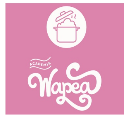
Figure 15: Cooking Academy (Academia Wapea) logo

The cooking-focused prototypes were all well received in the first prototyping phase. Strengthening cooking skills seemed like a promising way to encourage dietary changes for adolescent girls and to involve and build trust with a key influencer of the girls: their mothers. As for the Heroínas Game, three Cooking Academy sessions were tested with mothers and