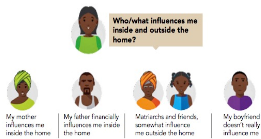
Figure 2: An overview of the people who influence adolescent girls' eating habits in Nampula.

There were many commonalities between the rural and urban findings related to food consumption. Adolescent girls in both rural and urban communities subsisted on a