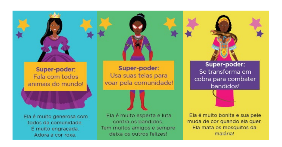
Figure 13: The three Heroínas created for the game

The formative research identified that there were few opportunities for the girls to play between their school and domestic responsibilities. The Heroínas Game endeavoured to support the child-like nature of the girls' social context and provide an opportunity for the girls to interact with their peers, build skills, knowledge, confidence, and motivation, and have fun. The game was designed to encourage the girls to change behaviour by completing weekly game 'missions' that, if completed successfully, were rewarded. Completion of missions allowed progression through levels and ultimately lead to them becoming a Heroína, represented by a character they chose at the start of the game (see Figure 13).