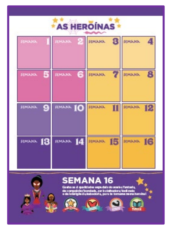
ANNEX 2: THE POSTER GIVEN TO PARTICIPANT GIRLS TO SHOW PROGRESSION THROUGH THE LEVELS AND TOWARDS BECOMING A HEROÍNA