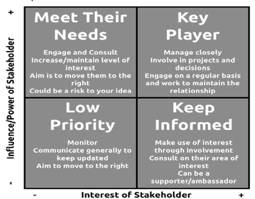
Figure 1: Power/Interest Grid (8)