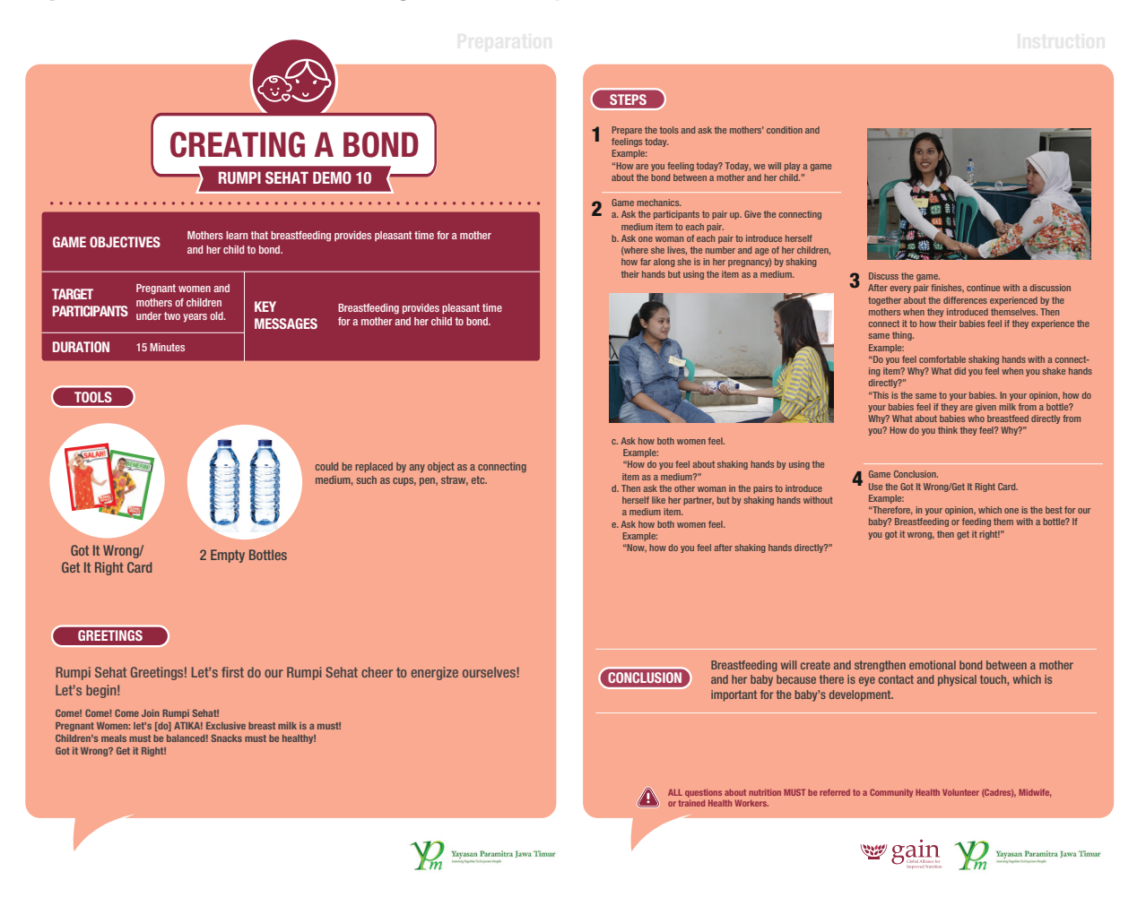
Figure 4: One of the emo-demo games developed under Baduta

In 2013, GAIN, together with partners, initiated the first phase of the Baduta programme in Indonesia's East Java Province. Baduta combined behaviour change interventions with other strategies to strengthen health systems and improve water, sanitation, and hygiene practices. One of the most original elements of Baduta was the use of emotional demonstrations – emo-demos – at health centres; interactive, emotive and surprising games designed for pregnant and lactating women.