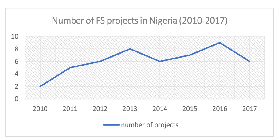
Figure 2. Project Number