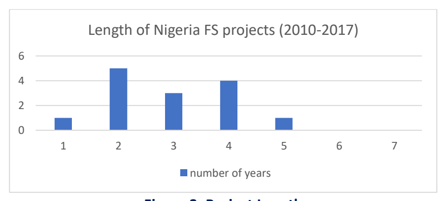
Figure 3. Project Length

The average food safety project in Nigeria lasted 3 years. There were no projects lasting 6 or more years (Figure 3). Many development experts believe it is difficult to attain lasting change with short duration projects and that time frames of ten or more years are optimal for impact. The short duration of projects is, hence, unfortunate.