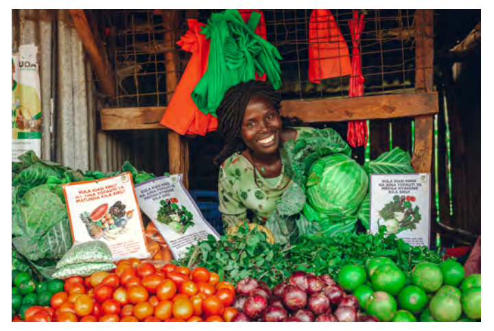
A trained Kiosk vendor' displaying educative food tags in market

The training was intended to enable the traders and for vegetable kiosk vendors around the tea factories to realise the potential role they could play in influencing the healthy food choices of the customers, and how this socially responsible role can still converge