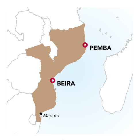
Figure 2: Location of Beira and Pemba.