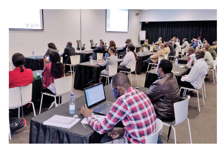
Figure 1: Beira—Policy workshop 1, July 2021

GAIN's policy and coordination work under the Keeping Food Markets Working (KFMW) programme, during and beyond COVID-19 focuses on collecting evidence and understanding urban food environments and the wider food systems in which they are embedded (See Appendix D). Efforts centre on urban traditional food markets as well as the co-design of policy options to be considered by policymakers in six cities, and/or urban counties<sup>1</sup>. The six cities/urban counties are: Beira and Pemba (Mozambique), Machakos and Kiambu (Kenya) and Rawalpindi and Peshawar (Pakistan). These endeavours aim to enhance good governance, urban food