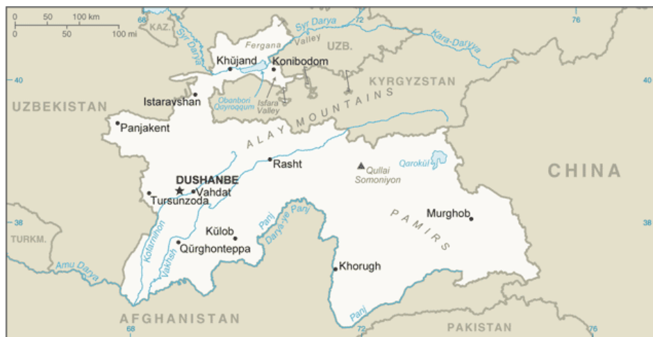
Figure 1- Map of Tajikistan