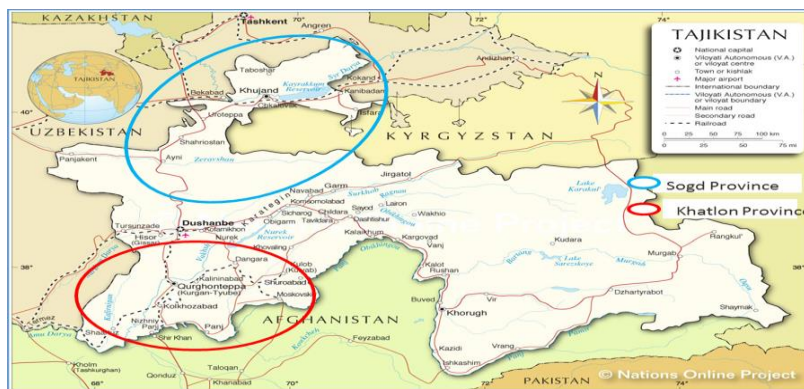
Figure 3- Tajikistan Rail Assessment

A list of mills known to the regulatory authorities is given under the contacts listed in Annex 1. Many of these mills, however, were not operating at all (some for some considerable time, judging by the condition of the buildings) and others only intermittently.