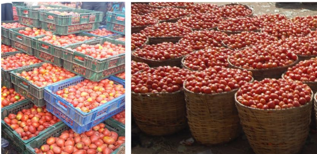
Figure 1: Tomatoes in reusable plastic crates and traditional woven baskets

Reusable plastic crates (RPCs) that are stackable and nestable are an alternative to traditional baskets and the standard packaging for FFVs globally, particularly for long distance travel and marketing (Fig 1). It has been noted that these plastic crates offer valuable benefits in preventing postharvest losses resulting from damage of fresh tomatoes transported across Nigeria. These have particularly been shown to help reduce in-transit damage from 41.12% in baskets to 4% in crates in packaged tomatoes in Nigeria [2, 3], thereby leading to higher income for the farmers and dealers of fresh tomatoes. Consequently, the use of RPCs as a replacement for baskets is being widely propagated for packaged FFVs, particularly tomatoes, for transportation and handling in Nigeria [3].