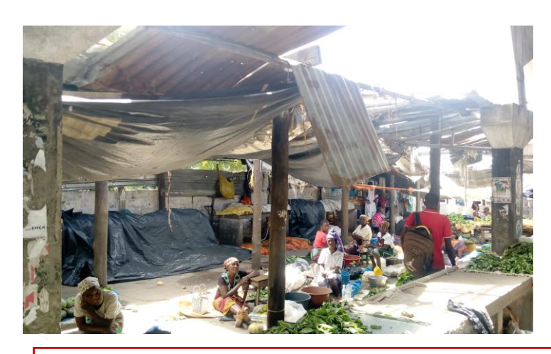
Vendors selling on the ground